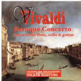
Vivaldi Baroque Concertos