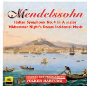
Mendelssohn Italian Symphony