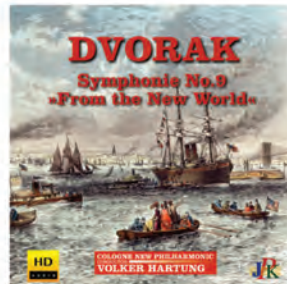
Dvorak Symphony No.9