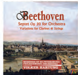
Beethoven Septet op. 20