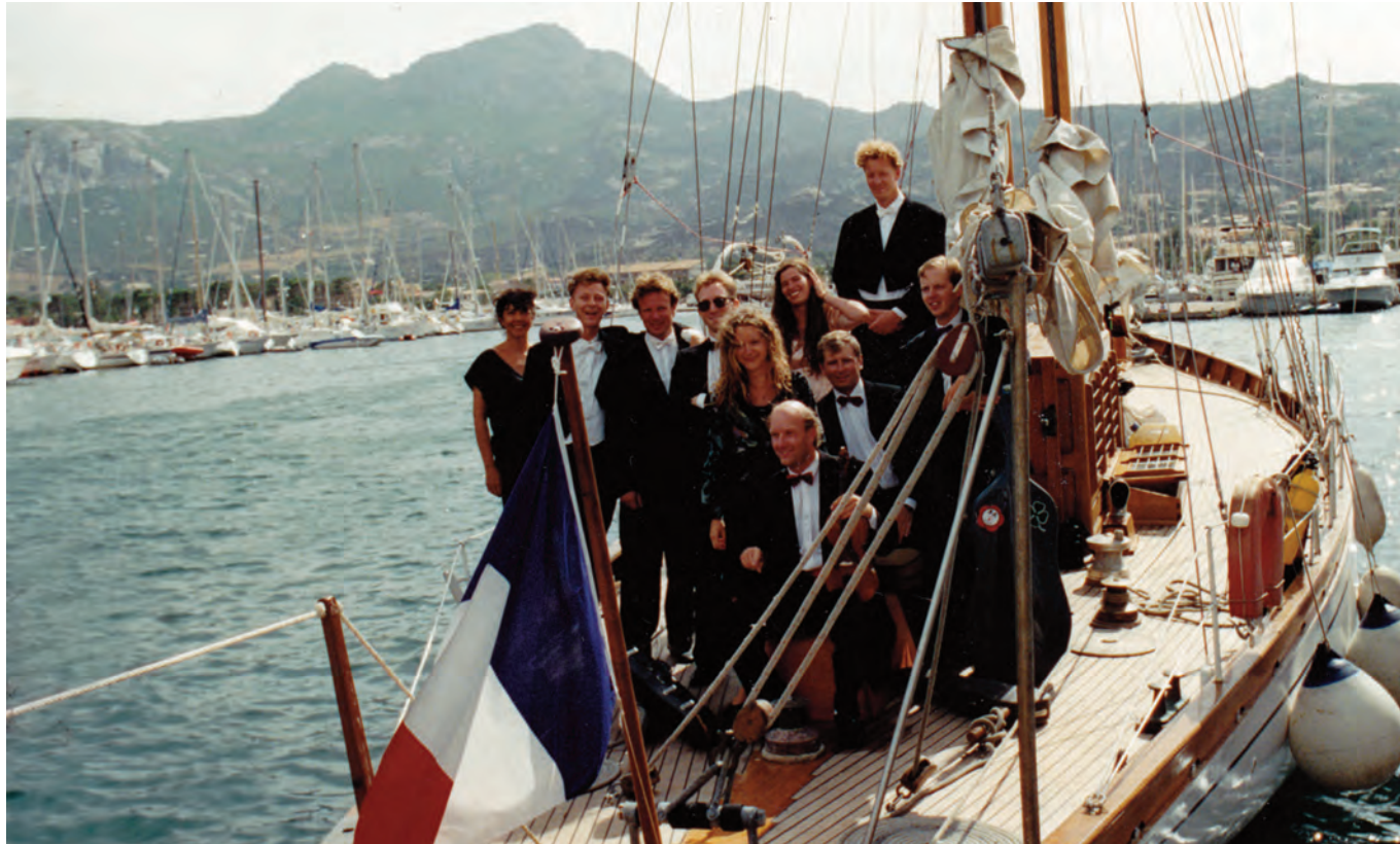
The Chamber Orchestra of the Cologne New Philharmonic on a concert tour in France