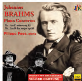
Brahms Piano Concertos