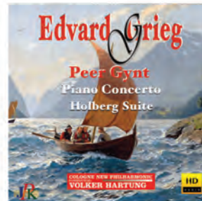
Grieg Peer-Gynt Suite Piano Concerto