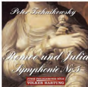
Tchaikovsky Romeo & Julia Symphony No.5