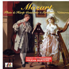
Mozart Flute & Harp Concerto