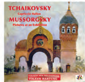
Mussorgsky Pictures at an Exhibition