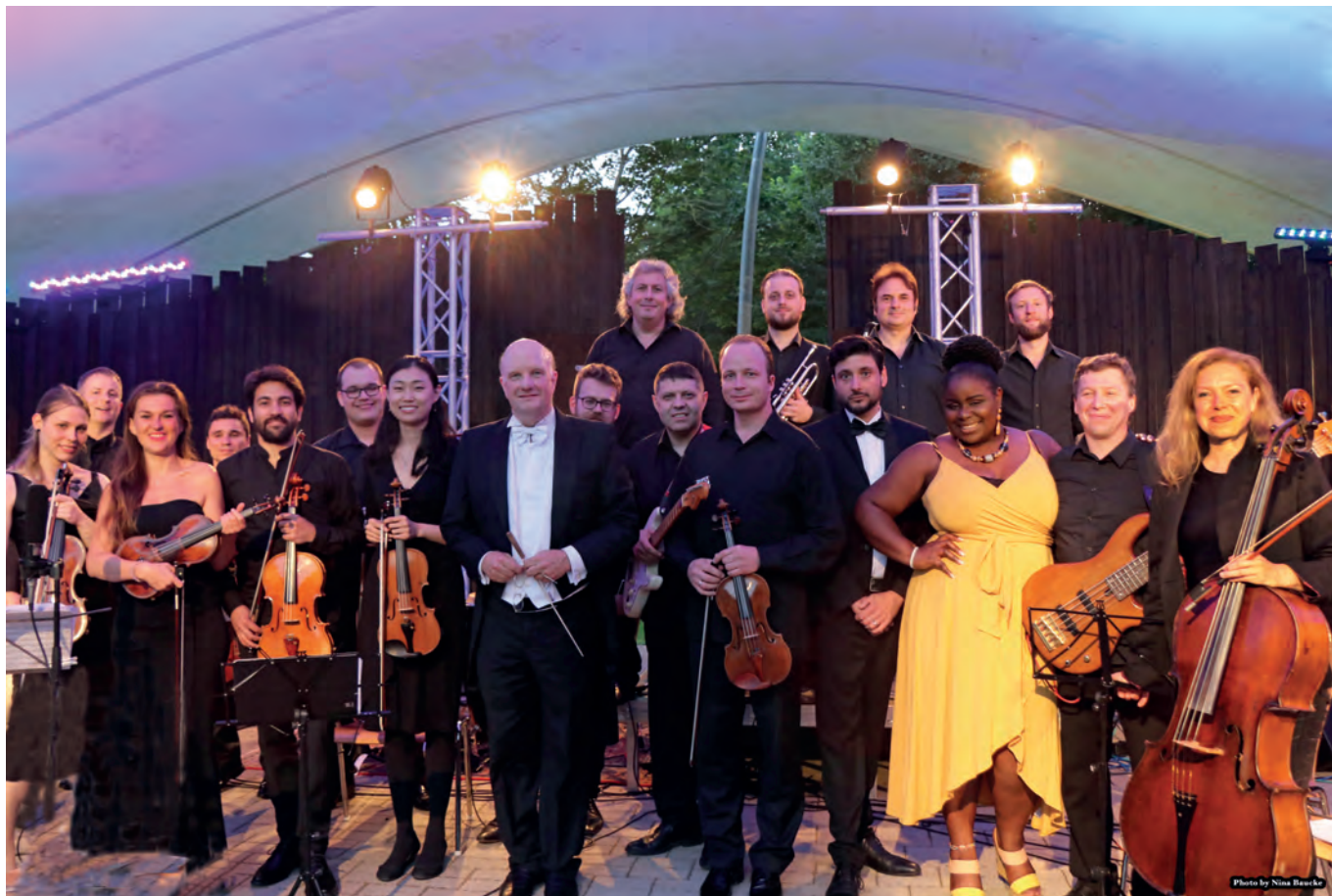
Cross-Over Concert with the Cologne New Philharmonic

When it comes to Australia, for example, the Cologne New Philharmonic not only plays in Sydney's famous opera house but also undertakes extensive