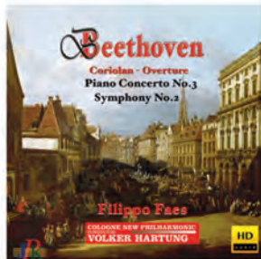
Beethoven Piano Concerto #3 Symphony No.2 - Coriolan