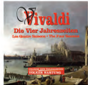
Vivaldi The Four Seasons